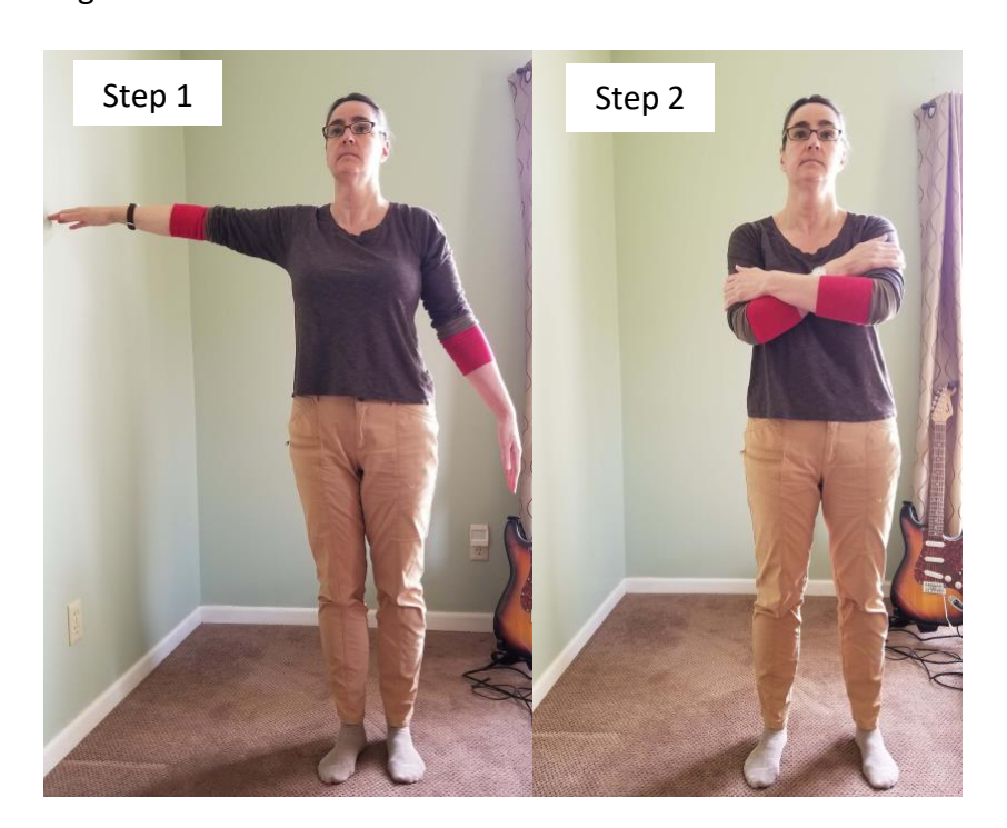
Do your fingers still touch the wall?