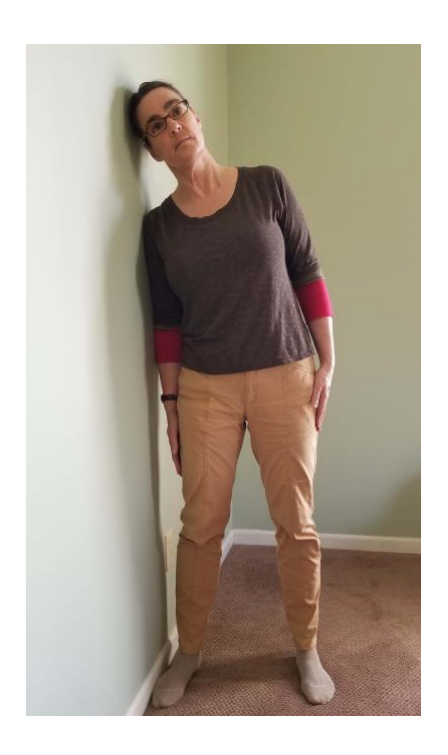
Were you able to lift your foot?