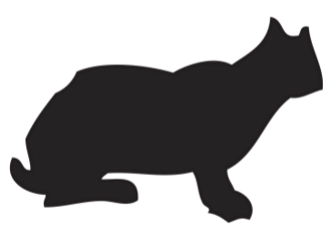
Hint: Also known as red lynx, this cat is known for its short tail.