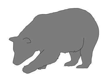
Hint: Despite its name, this omnivore's fur can be many different colors.